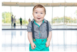
Jacob Kagami-Ogata Syndrome (only 53 documented cases in the world)